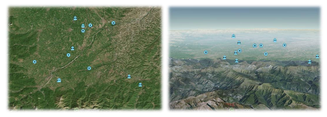
Figure 3. Tactical symbols, supplied by the symbol service, displayed in Carmenta Web Explorer 2D and 3D maps

The symbol service supports both 2D and 3D maps.