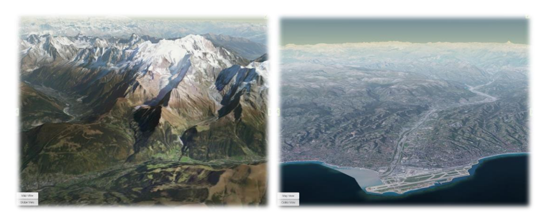
Figure 1. Realistic 3D imagery with the Carmenta Web Explorer 3D map client

WFS services published in Carmenta Server now support 3D coordinates, which means that vector layers can also be used as overlay layers in 3D maps with the correct elevation applied to all objects.